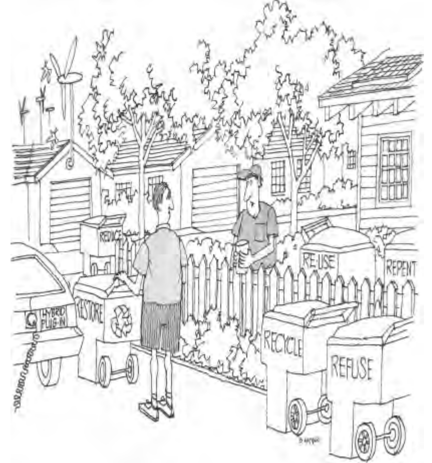
SAY ROD, WOULD YOU MIND IF I BORROWED A CUP OF CARBON CREDITS? I'VE EXCEEDED MY MONTHLY QUOTA.

Maybe you're one of those weak ones who has already jumped on the bandwagon of spying on your neighbor for 'their own good' (Community Oriented Policing, Asset Based Community Development, Neighborhood Watch, excluding people from neighborhood groups, reporting a neighbor for smoking in their apartment...). Flattery is a big manipulator.