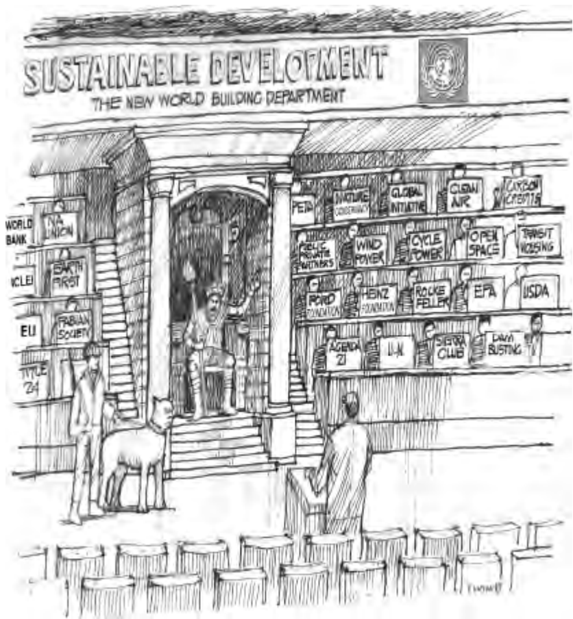
IN ADDITION TO YOUR APPLICATION FOR A BUILDING PERMIT BEING DENIED, WE INTEND TO CONFISCATE YOUR PROPERTY FOR THE COMMON GOOD!!

Your rights have been balanced. Welcome to the New World Order of the Twenty-first Century.