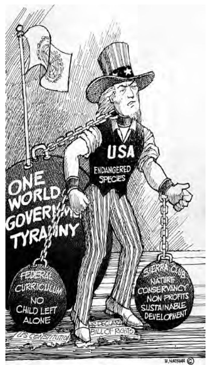
UN Agenda 21 is UN American