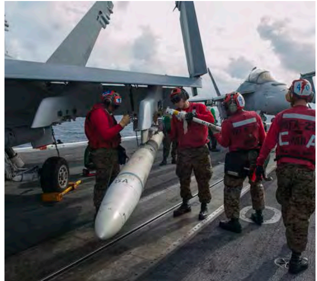
Marines assigned to the Thunderbolts of Marine Fighter Attack Squadron (VMFA) 251 remove a training AGM-88 HARM from an F/A-18C Hornet on the flight deck of the Nimitz-class aircraft carrier USS Theodore Roosevelt (CVN 71).

For example, investing in ballistic missile defense