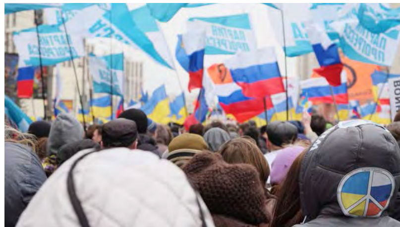
Muscovites protesting the war in Ukraine and Russia's support of separatism in the Crimea on the Circular Boulevards in Moscow on March 15, 2014.

While none of these measures has a high probability of success, any or all of them would prey on the Russian regime's deepest anxieties and might be employed as a deterrent threat to diminish Russia's active disinformation and subversion campaigns abroad.