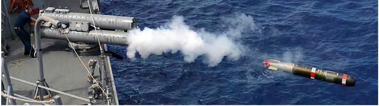
A U.S. sailor aboard the guided missile destroyer USS Mustin (DDG 89) fires a torpedo at a simulated target during Valiant Shield 2014 in the Pacific Ocean September 18, 2014.

Increasing U.S. and allied naval force posture and presence in Russia’s operating areas could force Russia to increase its naval investments, diverting investments from potentially more dangerous areas. But the size of investment required to reconstitute a true blue-water naval capability makes it unlikely that Russia could be compelled or enticed to do so.