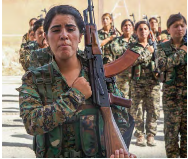
Syrian Democratic Forces trainees, representing an equal number of Arab and Kurdish volunteers, stand in formation at their graduation ceremony in northern Syria, August 9, 2017.

Promoting liberalization in Belarus likely would not succeed and could provoke a strong Russian response, one that would result in a general deterioration of the security environment in Europe and a setback for U.S. policy.